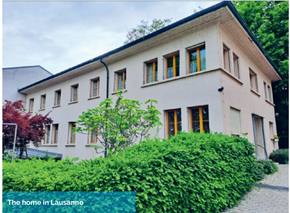
The home in Lausanne

We're very proud of this new project and hope that this small Foyer will become a big one!