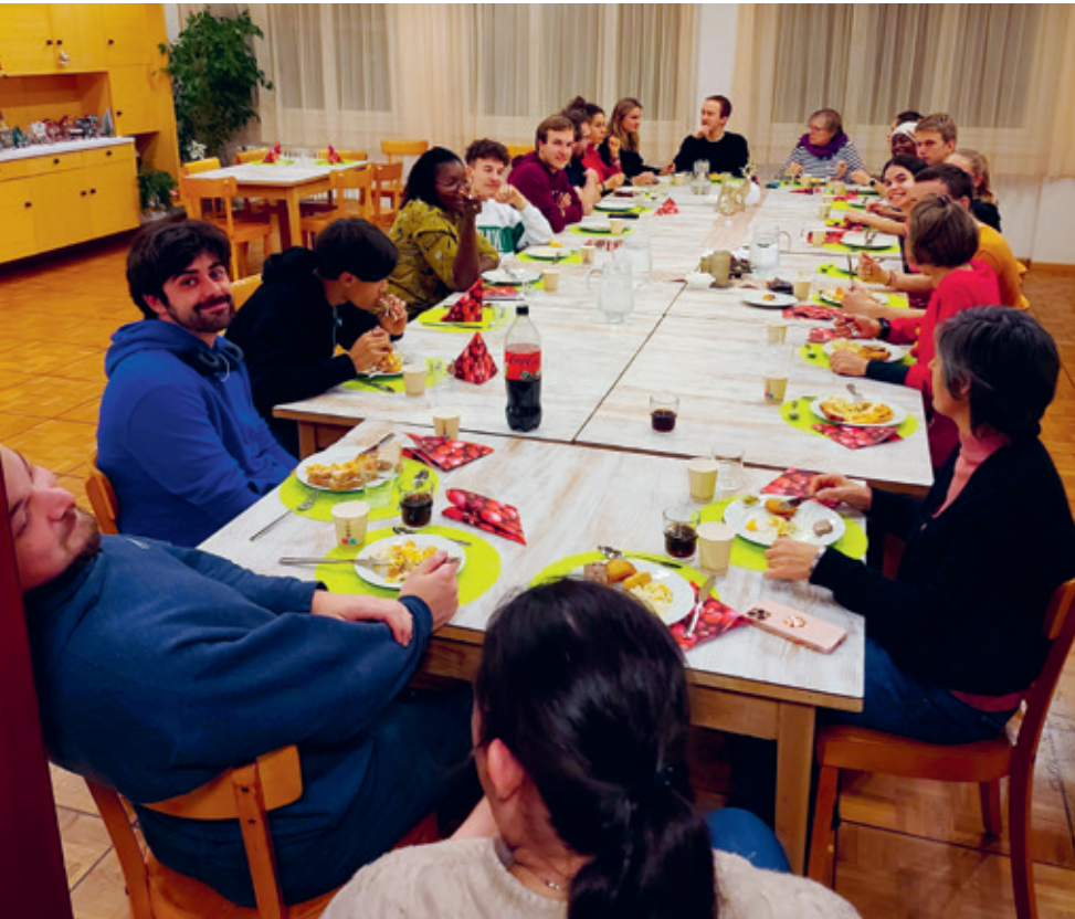
Christmas dinner prepared by the residents.

We would like to thank the chaplaincy of the Valais tertiary schools, which organises a collective meal every Wednesday evening with the residents and other external students. These are great opportunities to meet, share and discuss a wide variety of topics.